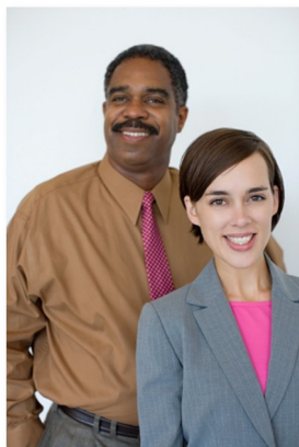
Are You Attracting Top Talent?